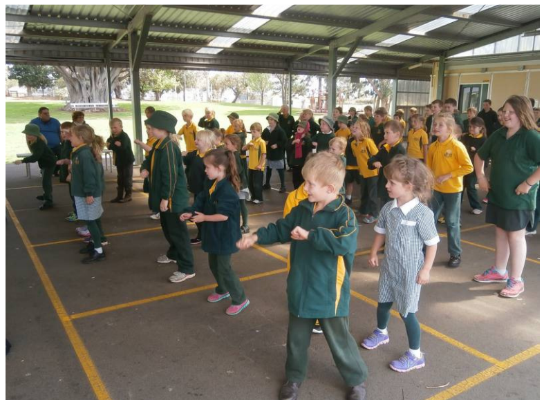
Students have been enjoying Footsteps dance lessons this week.