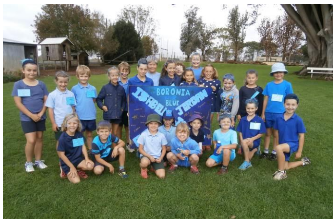
Boronia – 179 Points

For more information about short courses - or nationally accredited qualifications - contact the program at education@tafesa.edu.au