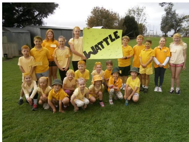
Wattle – 165 Points