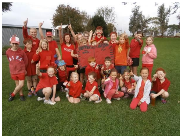
Bottlebrush – 155 Points