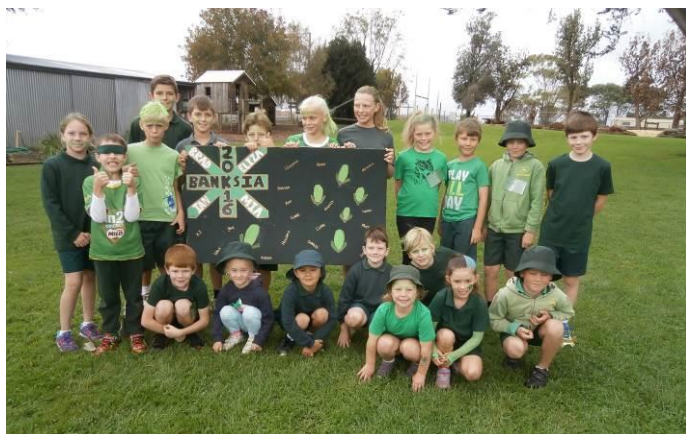
Banksia – 170 Points